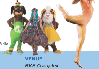
Buster & Bella