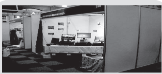
When Stand is left open over night with NO Safety Screen

Email orders form to ( orders@safetyscreens.co.za ) Subject heading : BLOEM18 NAME of stand or Fax to 086 620 6126