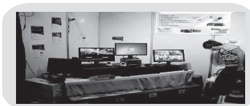
Petty theft deterrent, especially during the build up, break down days of a show and also when your store is left unattended